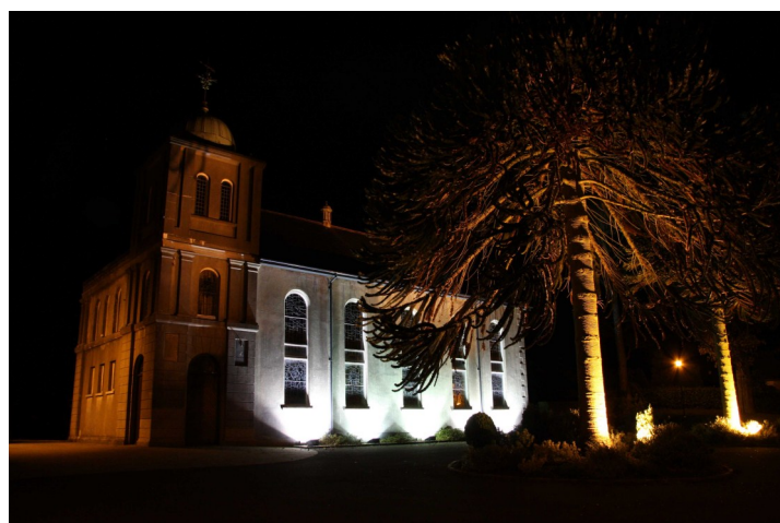
2nd Ballyeaston Presbyterian Church at Night

As this is our 250th Anniversary year, we will be entering into a very busy schedule of events over the next twelve to eighteen months. It is an exciting time for our church life and one that we plan to mark with events for all our congregation. We hope to